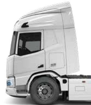
Sleeper High Cab