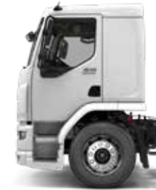
Extended Day Cab